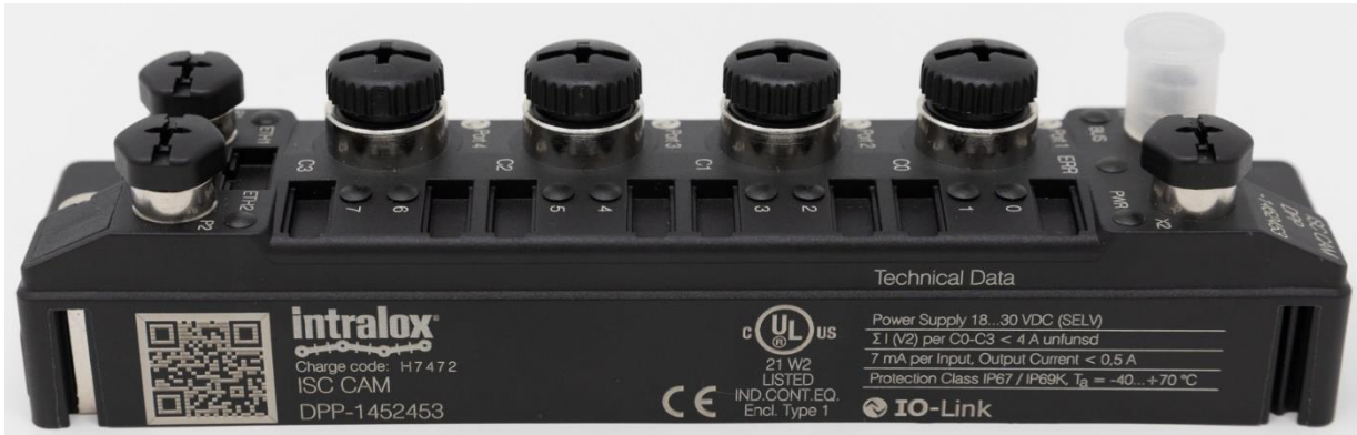
Figure 1: ISC CAM

Use the vHMI to export the application and setting files from the installed ISC CAM. If it is not possible to access the ISC CAM. Retrieve the application and setting files from the equipment technical file or contact Intralox Customer Service.