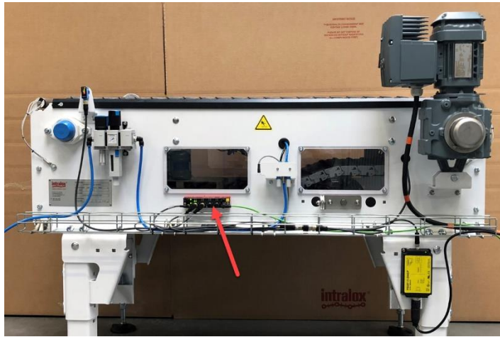
Figure 7: Install ISC CAM to side panel