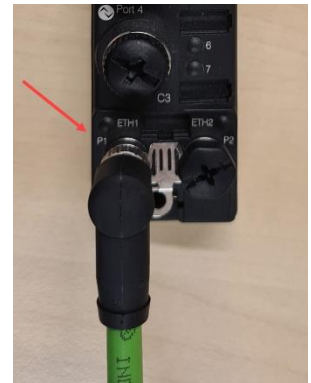
Figure 3: Network cable