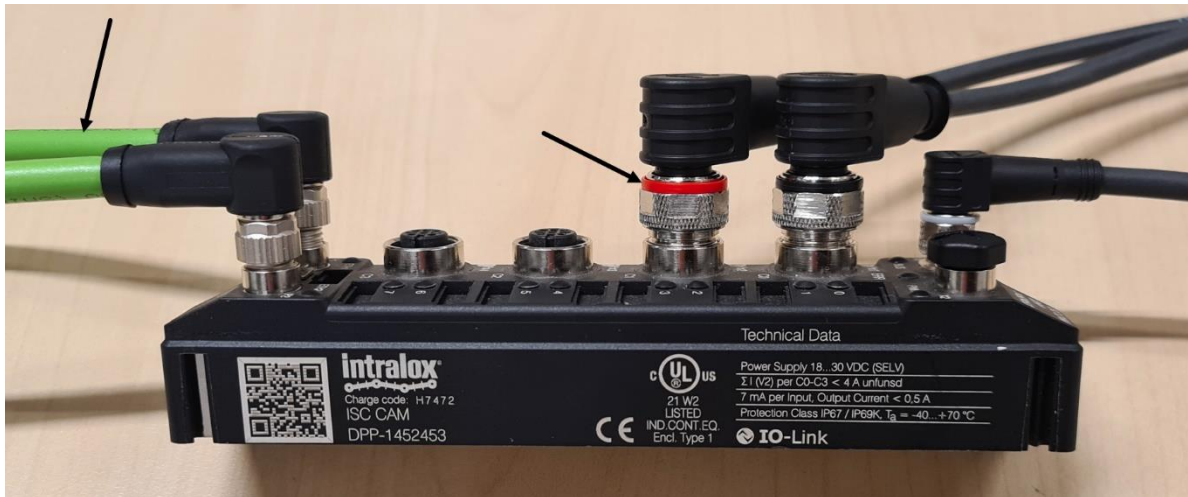
Figure 8: Cable connections and color coding