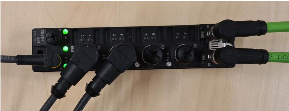
Figure 9: Cable connections

Connect the power cable to the new ISC CAM and connect the laptop to the ISC CAM with the network cable.