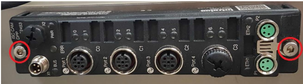
Figure 6: Screw locations